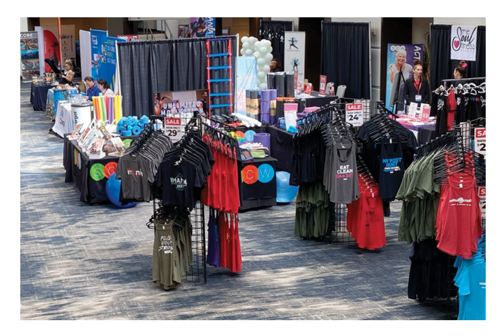
Exhibit at MANIA® and reach influential fitness pros with enormous buying power and consumer influence. This is ideal for new product sampling and program exposure!