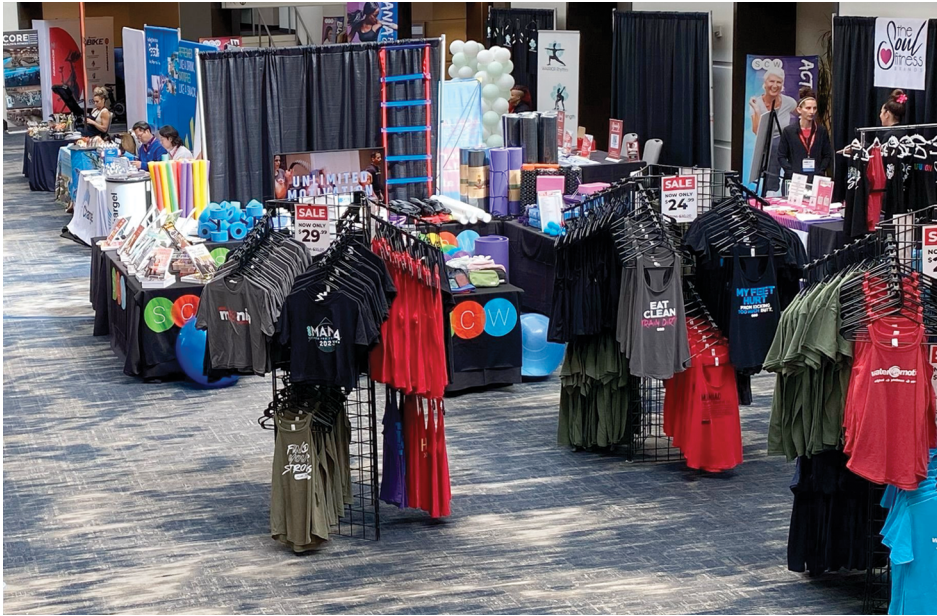
Exhibit at MANIA® and reach influential fitness pros with enormous buying power and consumer influence. This is ideal for new product sampling and program exposure!